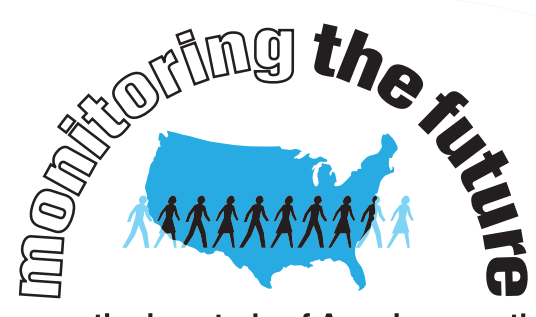
a continuing study of American youth

This questionnaire is part of a nationwide study of high school seniors, conducted each year by the University of Michigan's Institute for Social Research. The questions ask your opinions about a number of things—the way things are now and the way you think they ought to be in the future. In a sense, many of your answers on this be in the future will count as "votes" on a wide range of important issues.