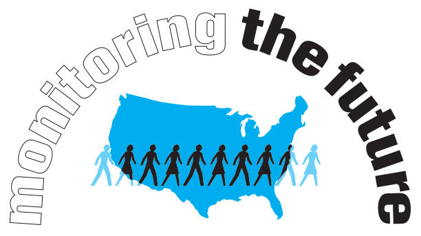
a continuing study of American youth

Survey Research Center The University of Michigan