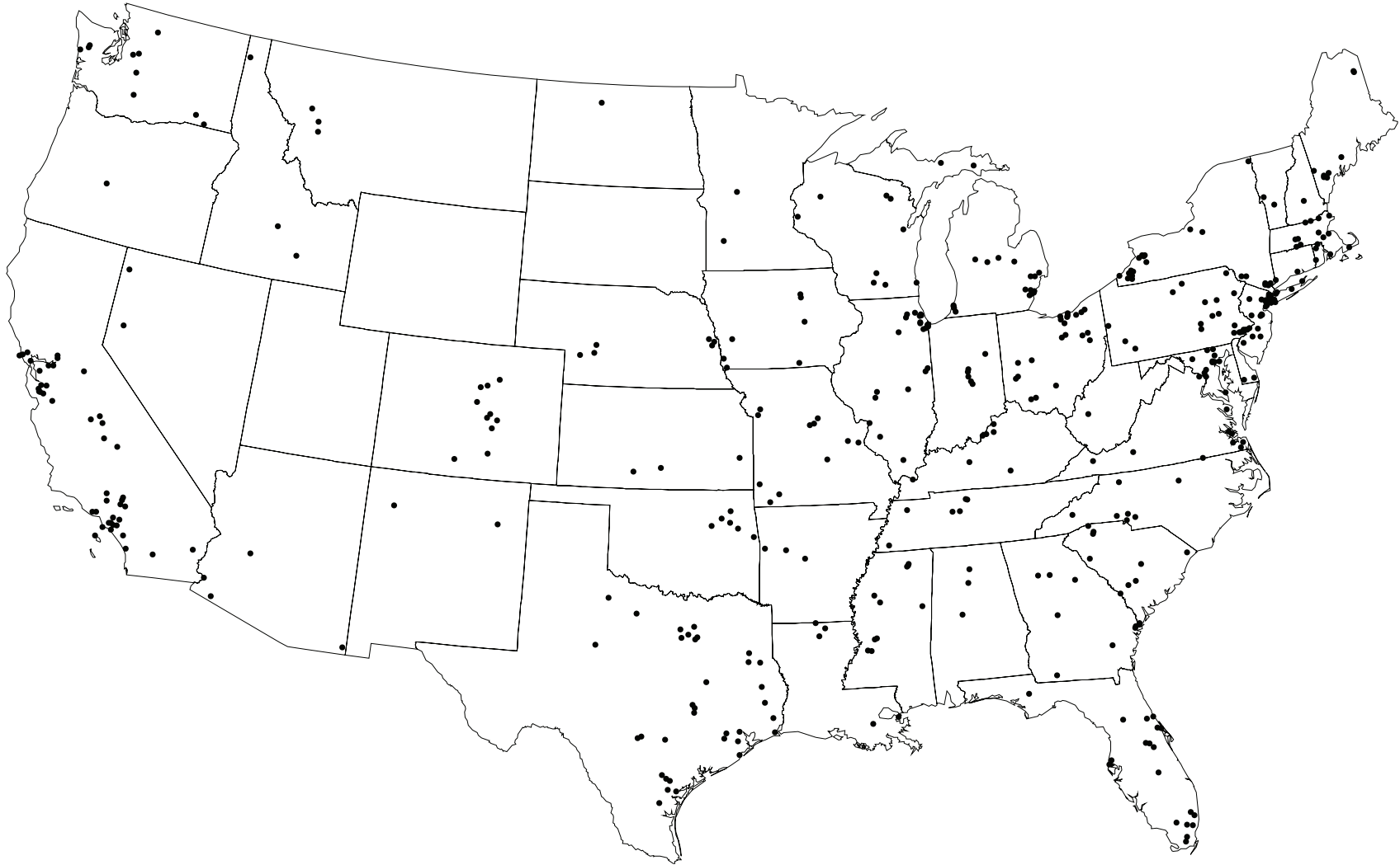
FIGURE 3-1 Schools included in 1 Year's Data Collection 8th, 10th, and 12th Grades

Note. One dot equals one school.